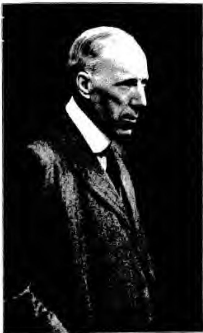
CECIL SHARP IN 1922.